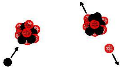
Before collision of neutron (black) with nitrogen-14 nucleus, 7 protons (red) and 7 neutrons. After collision, neutron is captured and proton is ejected, resulting in carbon-14 with 6 protons and 8 neutrons.

Experimental results presented at this conference demonstrate the well-known scientific principle that if linen, or any other nitrogen containing object, is irradiated with neutrons that carbon 14 (C-14) will be created within the irradiated linen. [16] These new C-14 isotopes are converted from nitrogen (N-14) within the molecular structures of the irradiated objects by the process illustrated below.