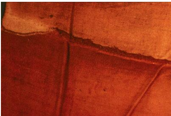
Figure 2. The light triangular area depicts the former location of the Raes sample on the Shroud. To its right is the location from which the radiocarbon samples were removed.

This test was performed at a nuclear accelerator facility using a linear accelerator mass spectrometer technique, which was one of the methods developed for dating small samples. This was not a dedicated laboratory that regularly carbon dated samples, but the results from both ends are worth noting. If one end of the Shroud thread dated to A.D. 200, the error range of the dating could place the Shroud in the first century A.D. The presence of starch could possibly explain why the other end of the thread dated to A.D. 1000. Since starch was located near the 1988 Shroud radiocarbon sample site, this and all future sampling locations on the Shroud should be investigated.