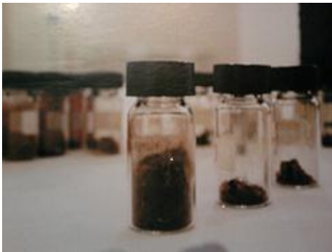
An abundance of charred material was removed from the Shroud in 2002 from which a small portion could easily be taken. (Fig. 5)

then another radiocarbon date is still going to yield a date in the approximate range of 800-1500 A.D. Such a date would not only be erroneous, but could greatly prejudice the public as this would be the second dating demonstrating that the cloth could not have wrapped Jesus. It would make little difference to the public when the Shroud was forged. The public would be much less likely to listen to an explanation about particle radiation after the Shroud was carbon dated twice to the Middle Ages.