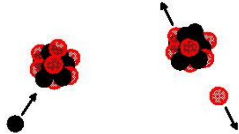
Before collision of neutron (black) with nitrogen-14 nucleus, 7 protons (red) and 7 neutrons. After collision, neutron is captured and proton is ejected, resulting in carbon-14 with 6 protons and 8 neutrons. (Fig.1)

in connection with the Shroud. First, the neutron flux within particle radiation will create C-14 isotopes within the molecular structures of all of these items. These new C-14 isotopes are converted from nitrogen (N14) within the molecular structure of these objects by the process illustrated below.